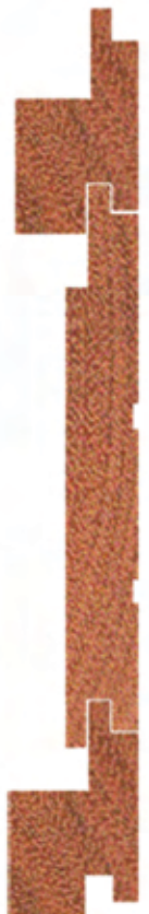
Donvale 140 x 21 (125 cover) & 60 x 32 (45 cover)

Selected profiles also available in other widths (65, 90, 140 & 180mm) and/or thicknesses (16, 19, 21, 32 & 42mm)