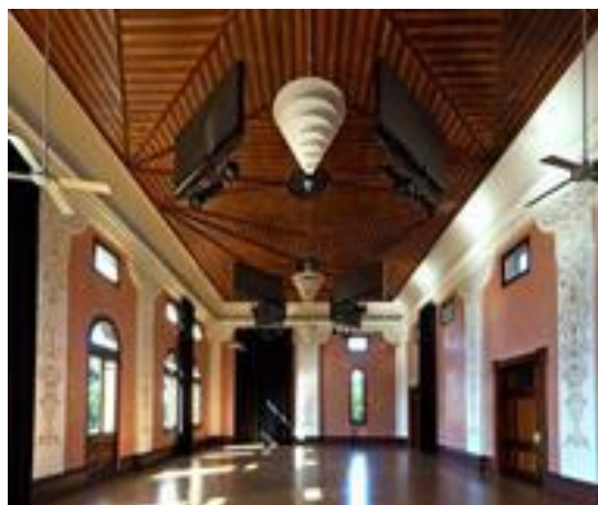
NEW FLOOR - HALL 2