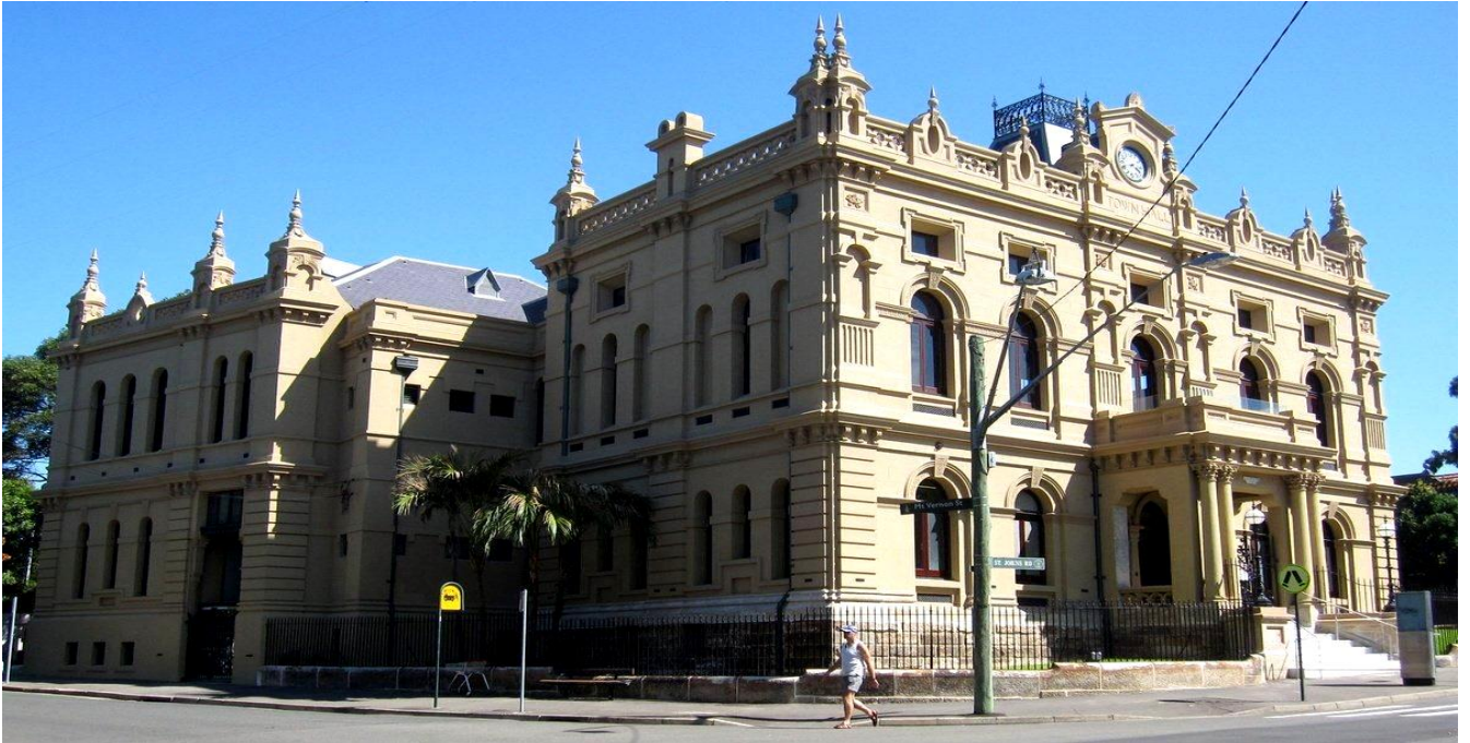
GLEBE TOWN HALL

ARCHITECT: TONKIN ZULAIKHA GREER - BUILDER: RAPID CONSTRUCTIONS - CLIENT: CITY OF SYDNEY