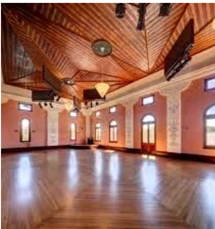
MAIN HALL – TIMBER FLOOR & CEILING