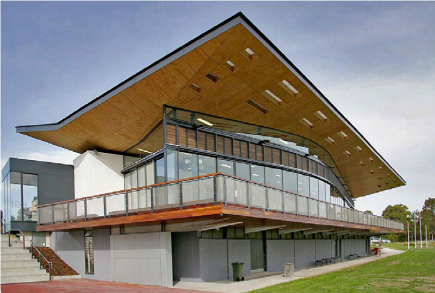
ULTRA MODERN DESIGN COMBINE WITH DURABLE TIMBER ELEMENTS