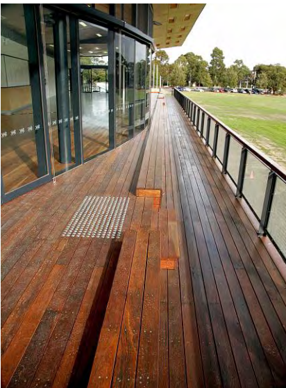
SPOTTED GUM DECKING, SEATS & HANDRAIL