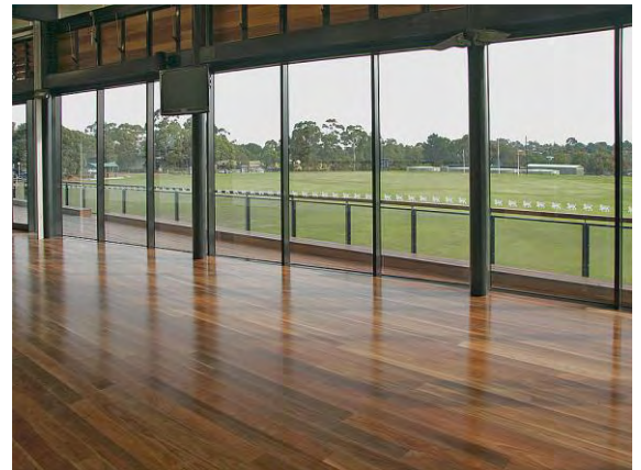
SUSTAINABLE SPOTTED GUM HARDWOOD