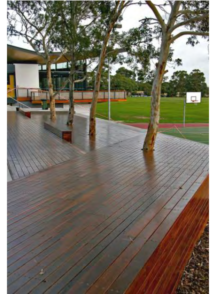
DURABLE SPOTTED GUM DECKING