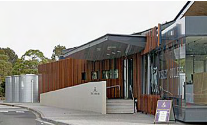
SPOTTED GUM MAIN ENTRY FEATURE WALL BATTENS